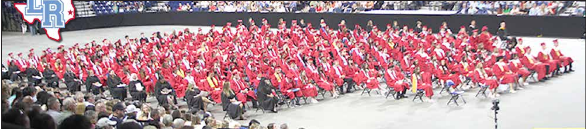
A total of 277 members of the Lumberton High School Class of 2025 were seated in the center of the Doggett Ford Park Arena last Friday night for graduation ceremonies.