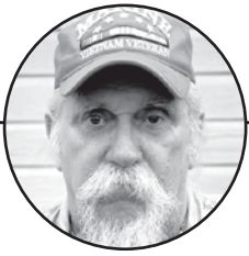
Guest Editorial By Jim Coonrod