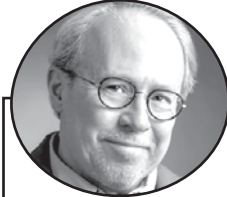
Capitol Highlights By Gary Borders